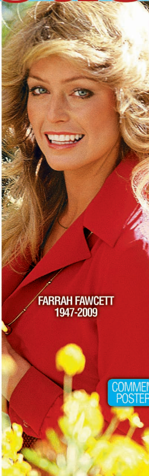
FARRAH FAWCETT 1947-2009

EXCLUSIVE THEIR LOVED ONES SHARE THEIR FONDEST MEMORIES